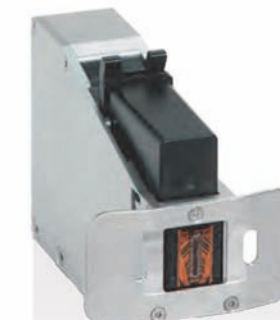
LX printhead (model 1)