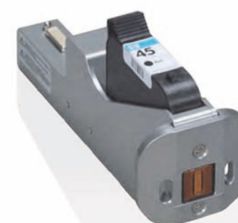
HP printhead (model 1)