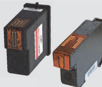
LX and HP cartridge Dual channel jet technology ensures perfect print quality