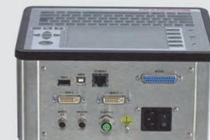
Ethernet Interface Data transfer from networks and access via web interface